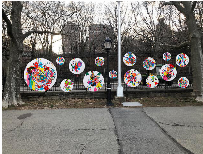
Blanka Amezkua, Happiness Is.... (photoshop rendering)